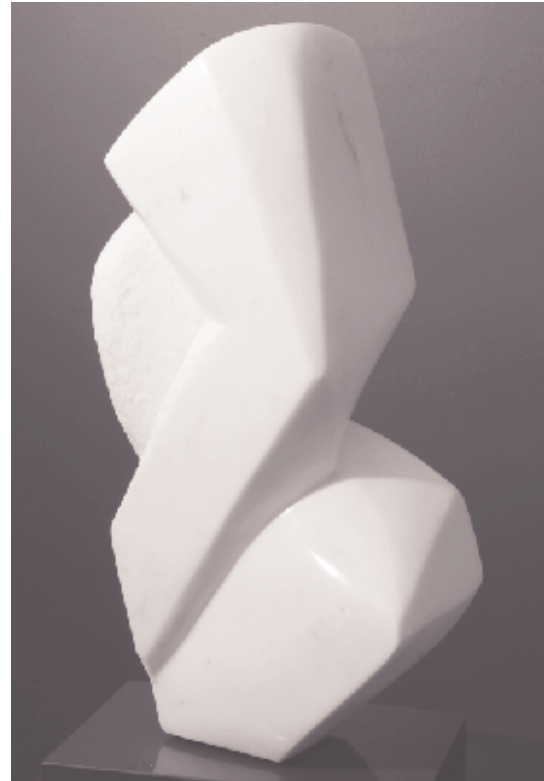
Sculpture by Edith Rae Brown , "A Moment Together", white Carrara marble.