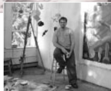
VSC's Red Mill (top) houses artist's studios like the one pictured above.