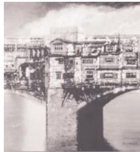
"View From the Studio, Florence" 2006

Elected to The National Academy of Design in 1988, he has since received their Andrew Carnegie Prize, Benjamin Altman Landscape Prize, Gervasi Award for Painting, the William A. Paton Award, and the Obrig Prize for Watercolor. Twice he received the William Ward Ranger Purchase Fund Award. The State University of New York has appointed him Faculty Exchange Scholar, and he is a professor in the School of Art and Design at FIT/SUNY where he has been awarded a New York State Research Grant for work in experimental media.