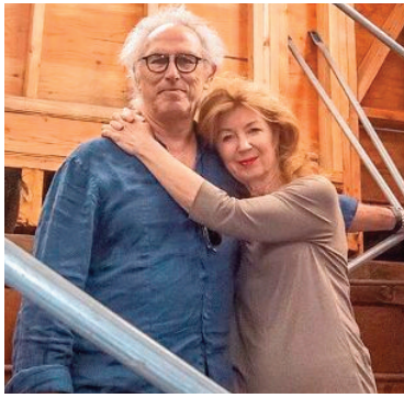
Eric Fischl and April Gornik at "The Church" in Sag Harbor, NY.

E ric Fischl and April Gornik will accept the Benjamin West Clinedinst Memorial Medal at The Artists' Fellowship 2019 Annual Awards Dinner.