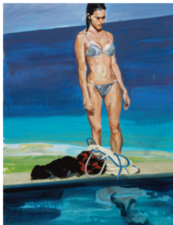
Eric Fischl, Self-Reflection , 2018, Oil on Linen, 65 x 50 in.

When the historic Sag Harbor Theater burned down in 2016, their non-profit Sag Harbor Partnership joined with the community to form the non-profit Sag Harbor Cinema Arts Center. Eight million dollars were raised to "rebuild, maintain, and operate the historic theater with programming and education for all ages." They recently purchased and are renovating a former church to serve as an art center and residency. "The mission of 'The Church' is to foster creativity on the East End and preserve the great history of Sag Harbor as a 'maker' village."