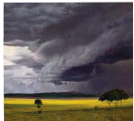
April Gornik, Storm Field , 2008, Oil on linen, 75 x 78.5 in.

The Clinedinst Medal is awarded for "the achievement of exceptional artistic merit, commemorates a dedication to the fundamental and traditional principles of Art and an interest in one's fellow artists." The fullness of Eric Fischl's and April Gornik's generosity make them perfect recipients of this award.