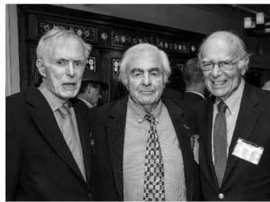
Daniel Schwartz, Everett Raymond Kinstler, Morton Kaish