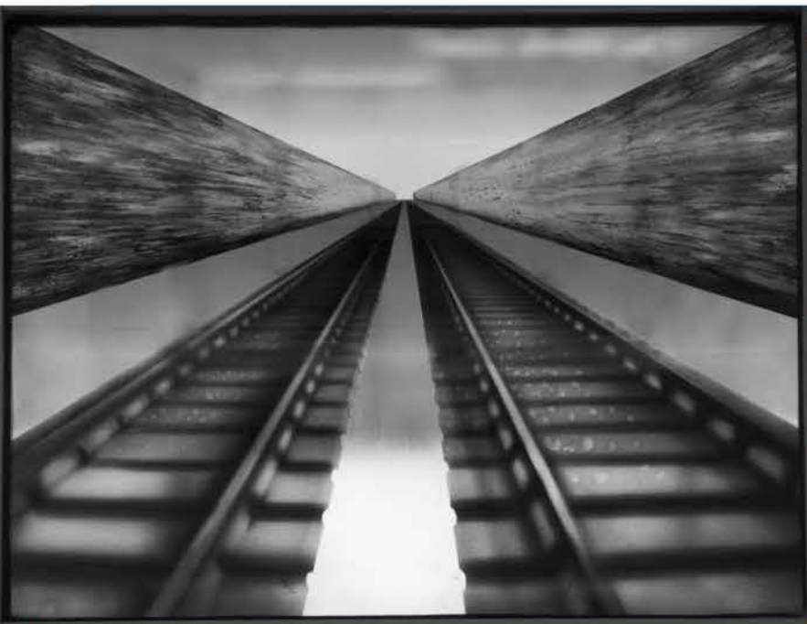
Peter Drake , Waiting for Toydot , laminated glass, 30" x 36", 2015