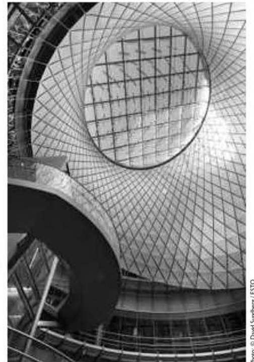
Sky Reflector-Net (2014) © James Carpenter Design Associates, Grimshaw Architects, and Arup, Fulton Center, Commissioned by MTA Arts & Design.