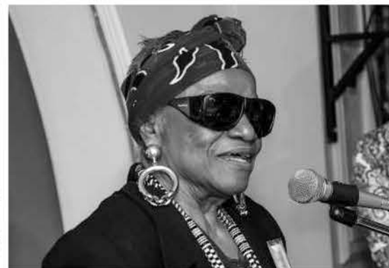
Faith Ringgold accepting Benjamin West Clinedinst Award