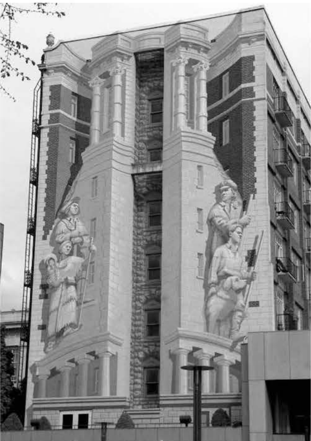
Richard Haas, Lewis & Clark mural, Sovereign Building, Portland, Oregon, 1989; commissioned by The Oregon Historical Society

Haas's murals have been commissioned for numerous public buildings in the United States. These include the Nashville Public Library; Chase Field; the Robert C. Byrd Federal Building & Courthouse in Beckley, West Virginia; the main branch of the New York Public Library; Lakewood Public Library, Ohio, the Sarasota County, Florida Judicial Center and the former Board of Education building in Brooklyn, New York. One of his most renowned works "Brooklyn Bridge," couples both his artistic brilliance with his architectural background.